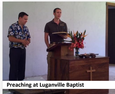
Preaching at Luganville Baptist